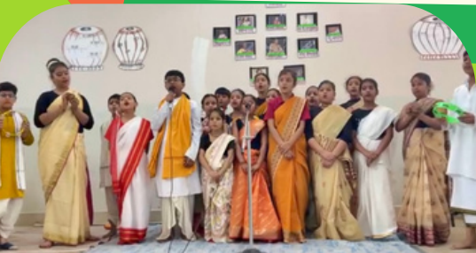
Celebrating BOHAG BIHU

On 15 April 2025, students of Classes 5 and 6 celebrated Bohag Bihu with great enthusiasm by participating in cultural activities that highlighted the traditions and significance of the festival.